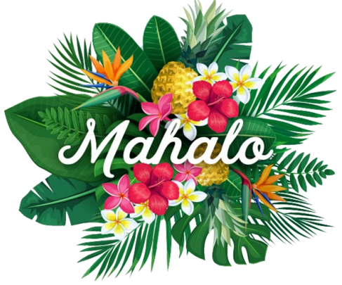
For your care and support!

It is an honor to do this work in this "house" and with this 'ohana, and I couldn't do this work without you.